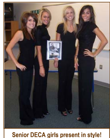
Senior DECA girls present in style!