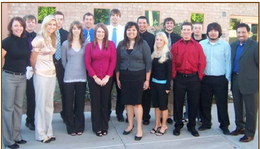
2008-2009 Marcos DECA Leadership Team

It's been a busy year for Marcos DECA students. From community service projects to competition, our students have learned to be strong leaders, give back to the community and gained valuable skills that will serve them well in the future. Students enrolled in any business class at Marcos can participate in DECA activities. DECA is an International organization of business students that provides opportunities for high school students to network with other ambitious students, learn from business leaders around the country, and earn scholarships from our corporate sponsors.