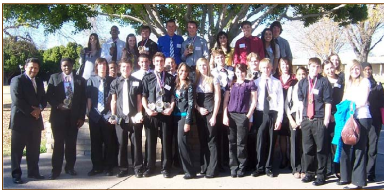
MdN DECA brings home the gold at the Eastern Area DECA competition

Our season kicked off with the DECA in the Pines leadership retreat for officers at Camp Shadow Pines in Heber, AZ. Students learned to lead their club members and get them excited about all that DECA has to offer. Next, our members participated in several community service projects. We collected more than 2000 items during our food drive for St. Mary food bank, and we recycled plastic bottles to help raise money for a young boy who needed heart surgery. Our senior DECA members also served as mentors for the Kyrene del Norte Elementary School bully prevention program hosted by Youth Frontiers. This was an incredible experience for our students, and we hope to make it an annual DECA tradition.