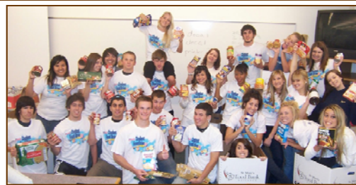
DECA gives back: We collected more than 2000 items for St. Mary's Food Bank!

To prepare for DECA competitions and the world of work, members attended various professional development activities this year. At the Western Region Leadership conference in downtown Phoenix, students learned about a variety of career fields from industry leaders and attended workshop on professional dress, competition and other business topics. We also attended the Sports and Entertainment conference in Orlando, FL, where students learned how to promote major sports teams, theme parks and entertainers. Our keynote speakers included the marketing executives from NASCAR and Universal Studios. Students also attended a performance by the world famous Blue Man group and spent a day enjoying all the attractions at Universal Studios.